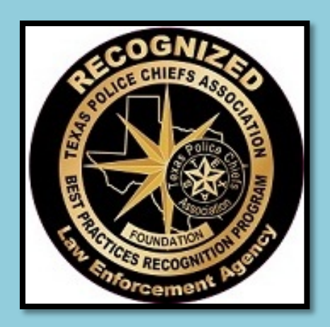
Texas Law Enforcement Recognition Program

The Texas Law Enforcement Recognition Program is a voluntary process where police agencies in Texas prove their compliance with 164 Texas Law Enforcement Best Practices. These Best Practices were developed by Texas Law Enforcement professionals to assist agencies in the efficient and effective delivery of service, the reduction of risk and the protection of individual's rights. These Best Practices cover all aspects of law enforcement operations, including use of force, protection of citizen rights, vehicle pursuits, property and evidence management, and patrol and investigative operations.