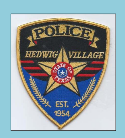
ANNUAL REPORT 2016