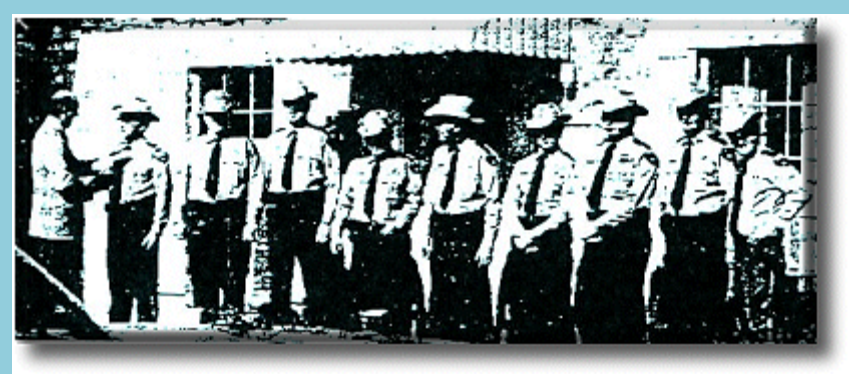
Swearing in of the original chief and eight officers.

Today, Hedwig Village is a dynamic city with approximately 2500 residents, over 500 businesses and a day-time population of around 30,000 people. The police department has become a fully functional modern department with 23 full-time employees.