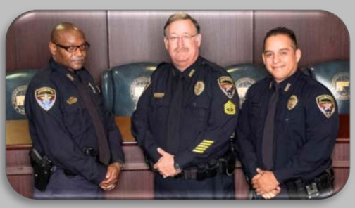
NIGHT SHIFT PATROL (NOT SHOWN – OFFICER ANDRA GIBSON)