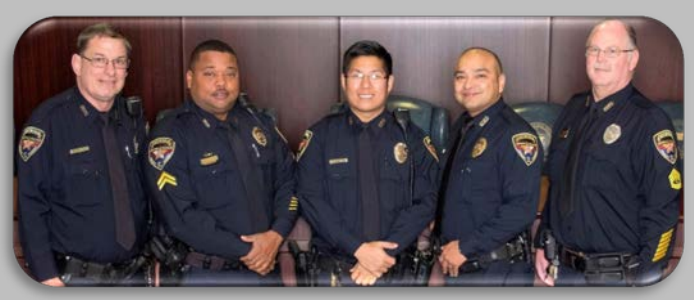
EVENING SHIFT PATROL