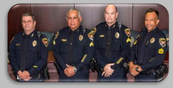
DAY SHIFT PATROL