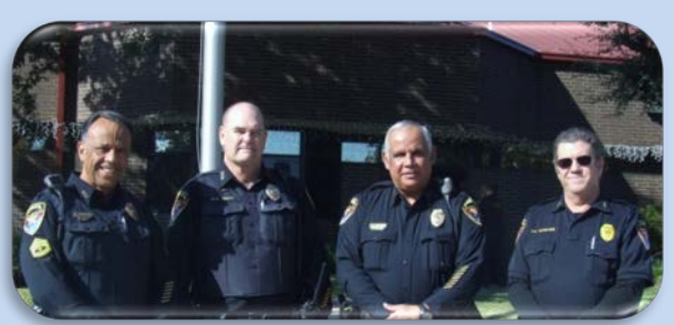
DAY SHIFT PATROL