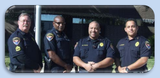
NIGHT SHIFT PATROL